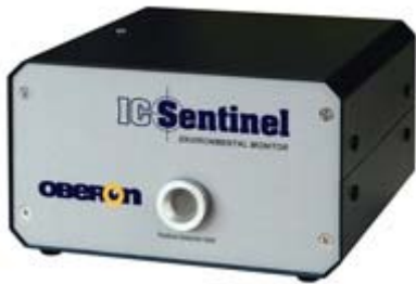
IC Sentinel® Sensor

IC Sentinel® is a real-time environmental quality monitoring solution, comprised of facility-wide, multi-sensor modules and cloud based data collection and reporting software. IC Sentinel® is designed to assist infection control professionals and contractors in hospitals, and facilities and environmental managers in data centers, monitor, collect, report, and address critical air quality and environmental factors such as particle count, differential room pressure, air quality, humidity, sound, and light levels.